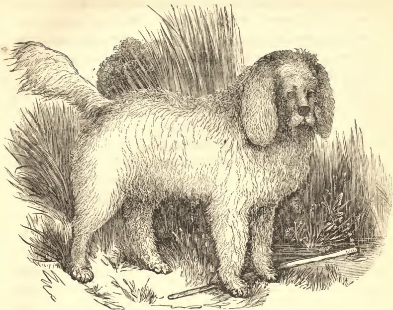
R I O .

a magnificent trophy of his hook and line, as he raised it from the water in one of his wonted angling excursions, for relaxation and recreation. Washington Irving, in his life of Goldsmith, traces two of the most beautiful lines in the Traveller to quite as curious an origin. He says: "We hear much about poetic inspiration, and 'the poet's eye in fine phrenzy rolling.' But Sir Joshua Reynolds gives an anecdote of Goldsmith, while engaged upon this poem, that is calculated to change our notions about the ardor of composition.